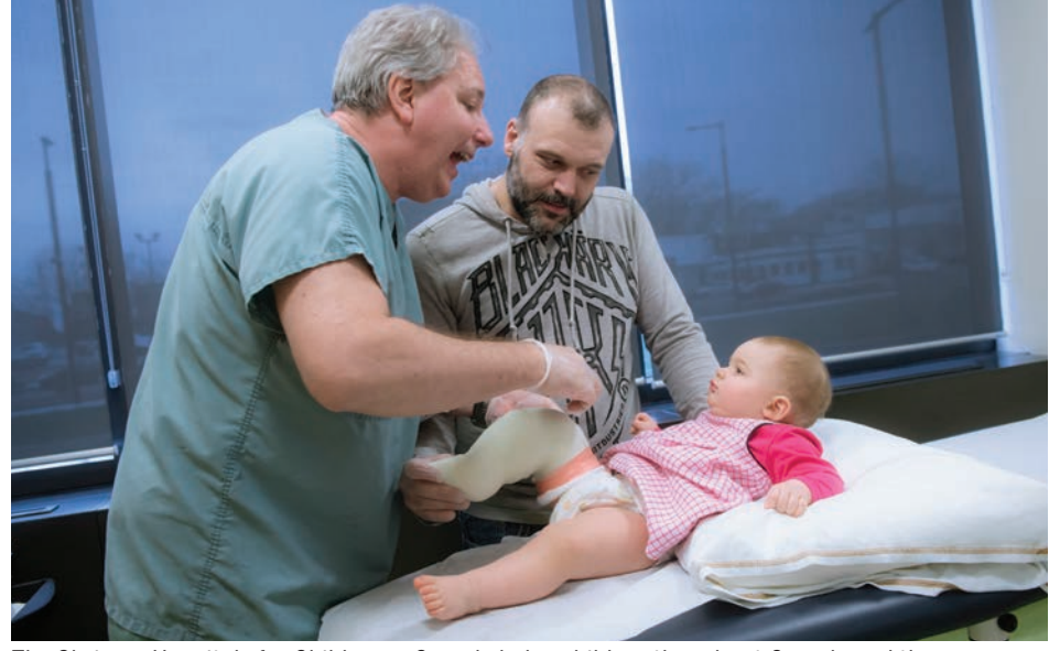
The Shriners Hospitals for Children — Canada helps children thoughout Canada and the northeastern United States.