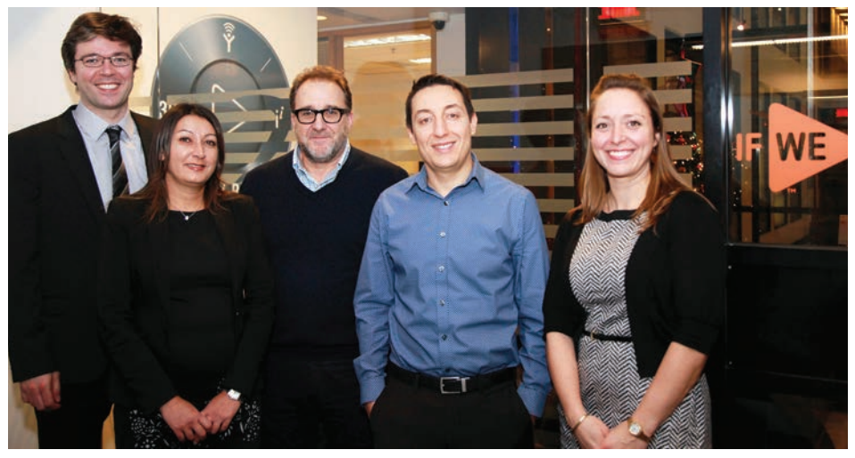
A great team spirit and fun environment give software giant Dassault Systèmes the edge as a top employer.

Recognizing that a company is only as great as the people who make it, Dassault Systèmes takes care to evaluate what workplace practices it can improve on. Each year, the company conducts a Great Place to Work survey where each manager reviews with his/her team how they think the company can improve. Outcomes have included implementing one-on-one meetings with managers to increase communication, increasing net-