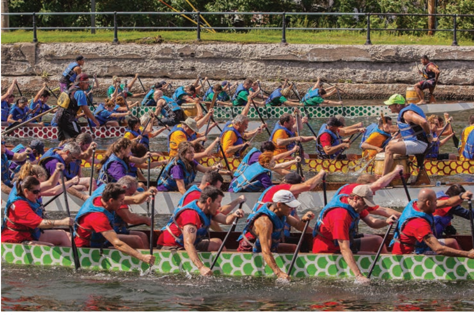
CSL employees participate in the company's Paddle for a Purpose charity event. CANADA STEAMSHIP LINES

To ensure the company remains a great place to work, CSL surveys its employees