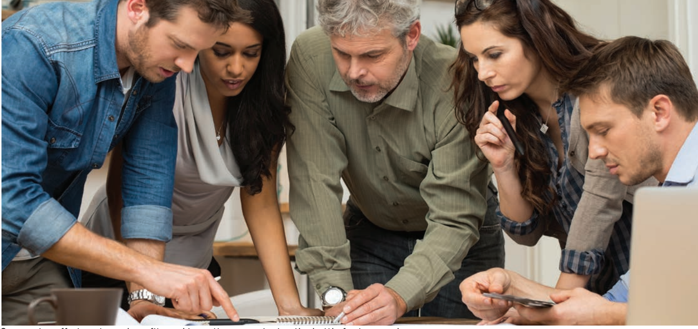
Companies offering strong benefits and incentives are winning the battle for top employees.

"People are creating collaborative workspaces and telecommuting floors where people that work from home can come in