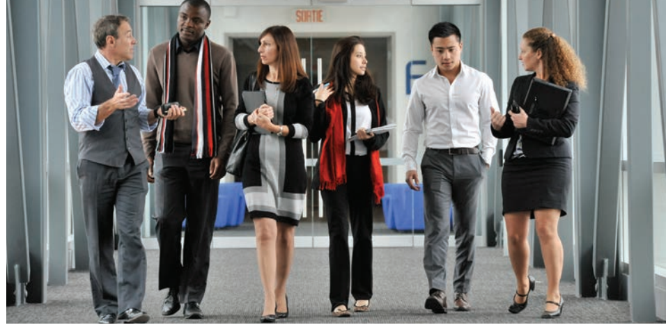
Team members at Bell Canada's LEED-certified headquarters located on Nuns' Island, Montréal.

Bell's participation in the student internship program, Career Edge, also takes in