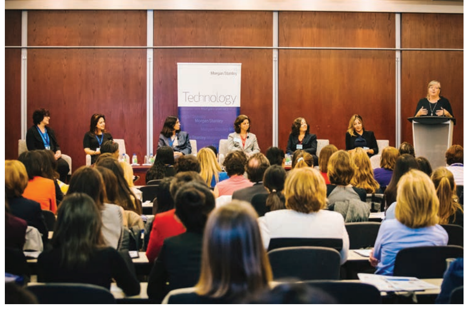
Senior managers offer guidance to women in technology through a career panel at Morgan Stanley's diversity event in Montreal.

Morgan Stanley is a global financial services firm providing a wide range of investment banking, securities, investment management and wealth management services. Since setting up shop in Montréal in 2008, Morgan Stanley has been attracting some of the most brilliant minds in the IT industry. More than 500 software developers, engineers and architects based in Montreal work on exclusive e-trading platforms, pricing engines, risk management and security and infrastructure platforms, used by the