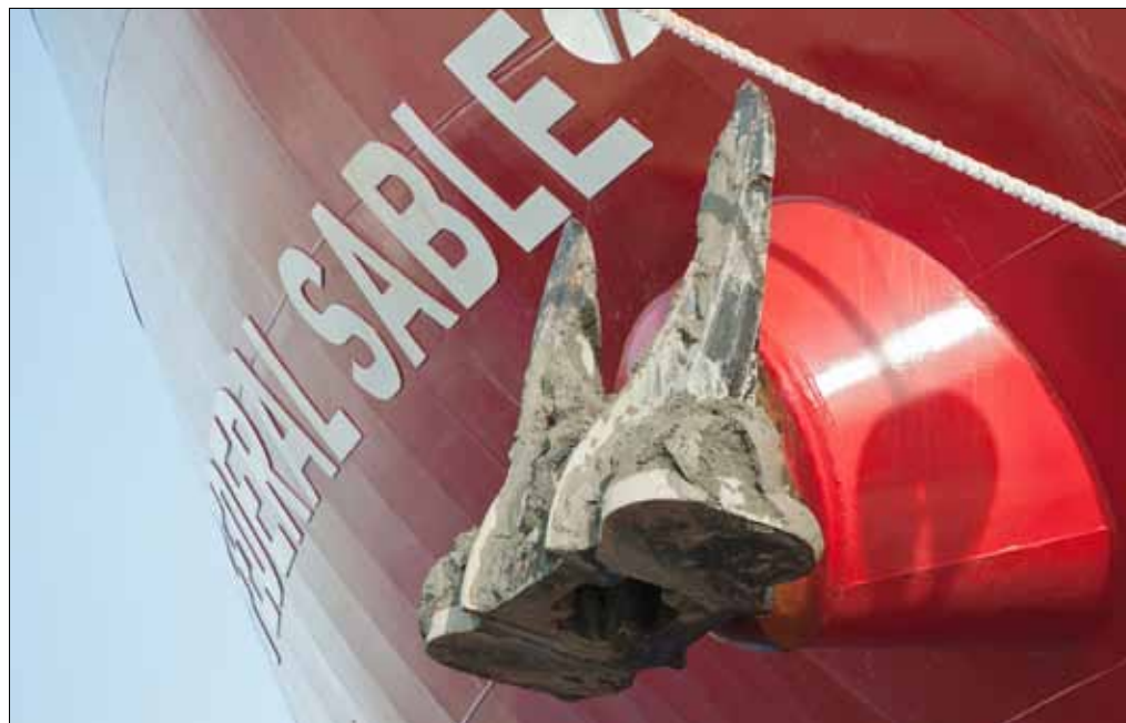
Fednav continues to expand its operations in the shipping industry while excelling as an employer of choice.

Since she started at the company five years