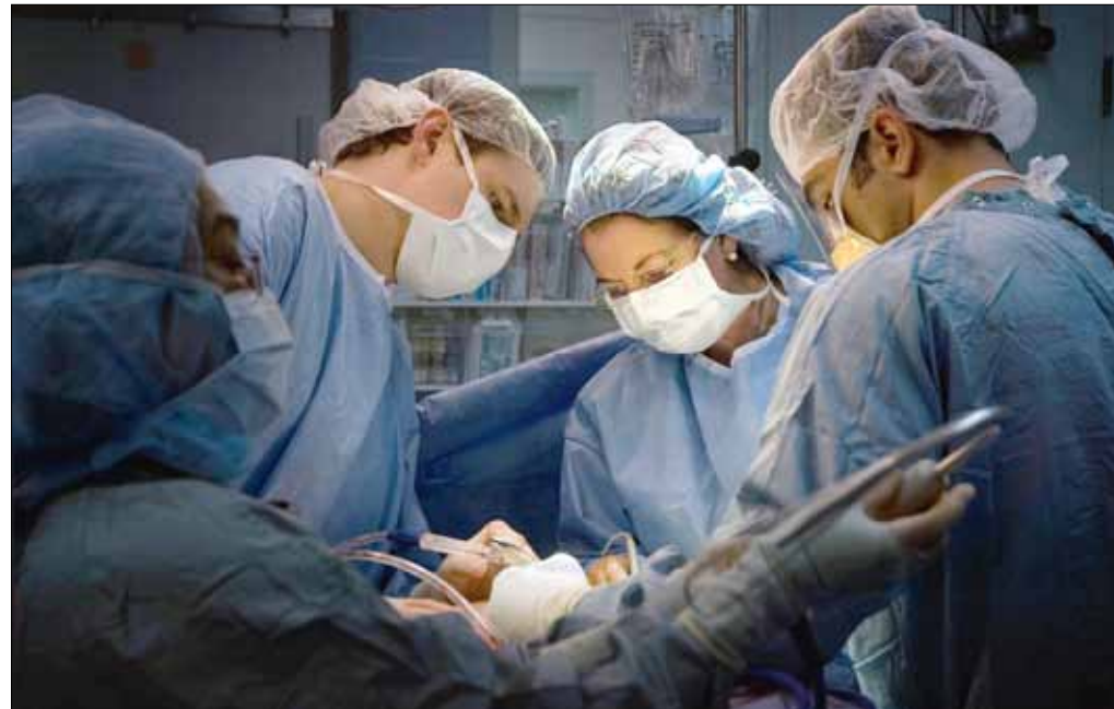
Teamwork is paramount at McGill University Health Centre, where everyone is encouraged to collaborate.

"When they leave, they really have the feeling they have concrete tools to better understand their situation and are more positive about their recovery."