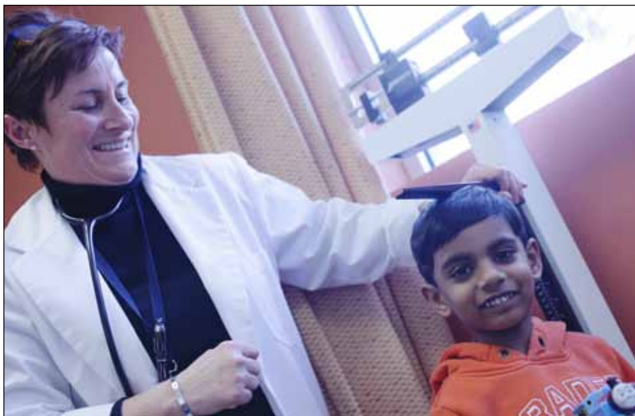
The challenge for companies today is balancing the needs of older workers with the expectations of new graduates.

life expectancies are longer. People don't want to be retired for 30 years or they can't afford it."