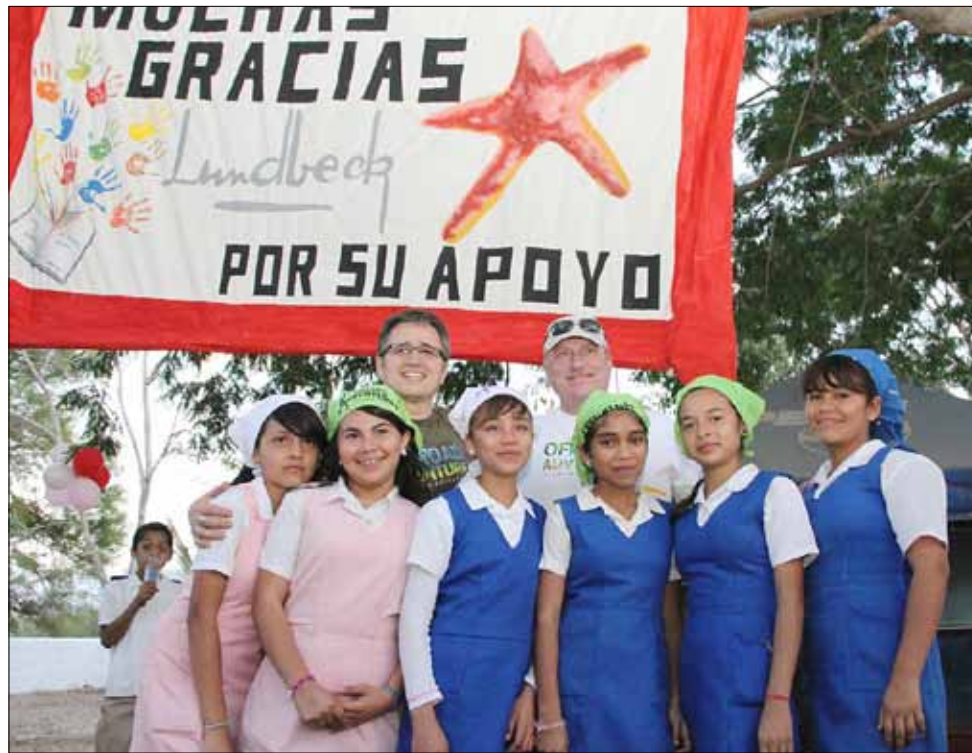
Lundbeck employees help restore schools in Mexico.

Employee excellence and quality outputs are recognized through a well-developed