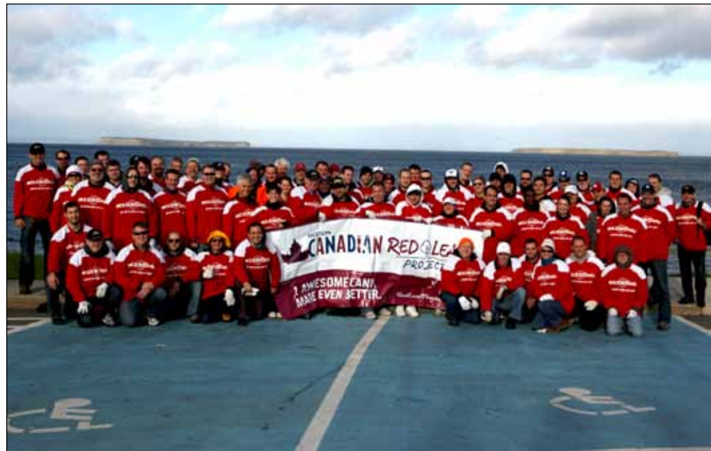
Molson Coors employees in the community.

"The employees become Certified Beer Enthusiasts," explains Moncton-based sales