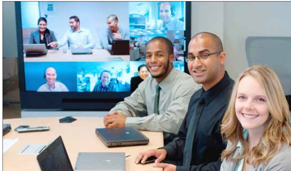
Bell Canada team members stay connected through video conferencing, a technology the company offers to business customers across the country.