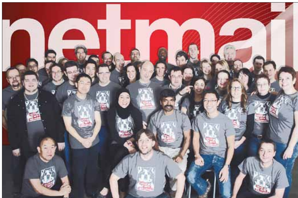
At Messaging Architects, a relaxed work environment inspires creativity.

A relaxed environment where people feel stimulated to generate new ideas related to the company's business of email risk management — one of the hottest IT trends worldwide — is key to the longevity of employees' careers.