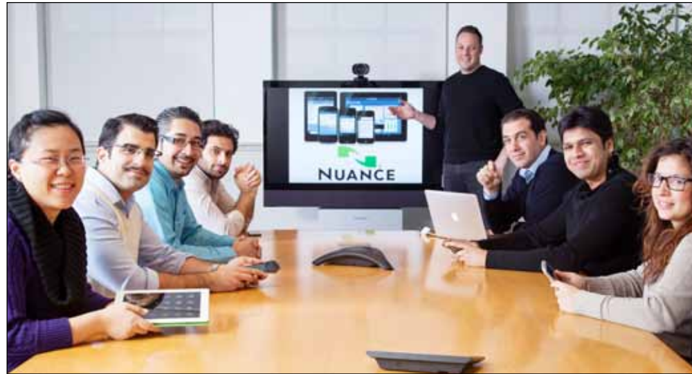
Stoffel De Roover/Lumendipity

Full health and dental coverage is in effect on their first day of work, as well as four weeks