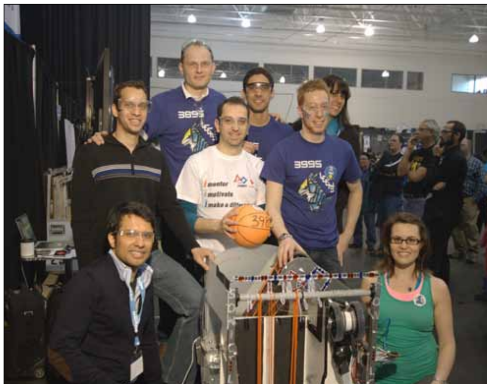
Vigilant Global presents its employees with plenty of team-building volunteering opportunities, like the FIRST Robotics competition, where employees work side-by-side with high school students to build a championship-worthy robot.