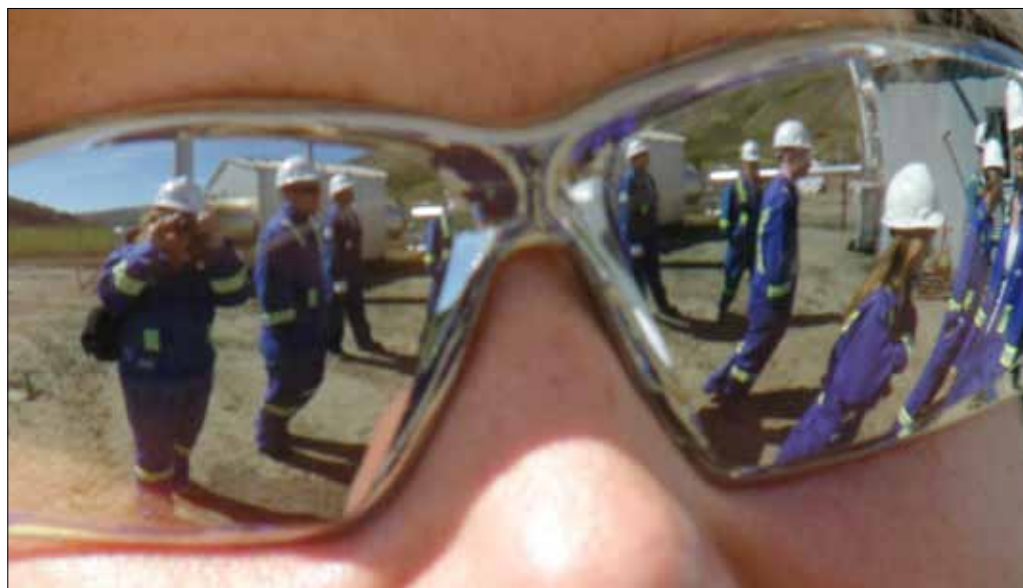
The Fort St. John-based BC Oil and Gas Commission has grown to meet the needs in five regional offices.

The Commission is also clear in its dedication to employee growth. It supports opportunities for employee growth, recognizes individual and group contributions, demonstrates accountability at all levels and instills pride and confidence in its organization.