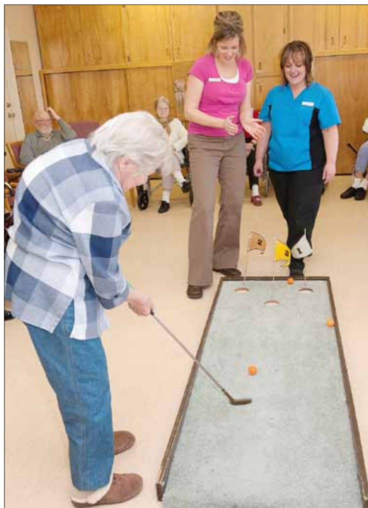
Vancouver Coastal Health offers a full range of health services.

Because VCH offers a full range of health services, from emergency care to rehabilitation and mental health services, it allows for maximum job growth within the same health region — an important consideration for an ambitious new hire.