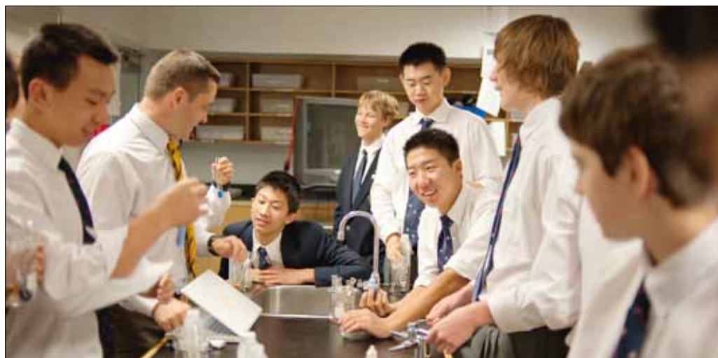
St. George's School offers students a challenging, yet supportive, environment.

"It's important we have community engage-