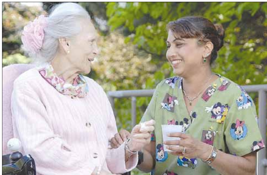
Providence Health Care’s staff, physicians and volunteers are dedicated to service and support.

Providence’s 1,200 physicians, 6,000 staff members and 1,600 volunteers provide compassionate care to patients and residents from all over British Columbia.