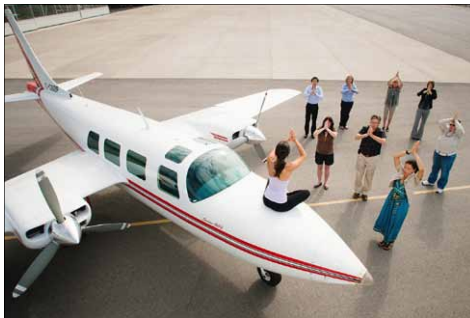
BCIT Aerospace Campus.