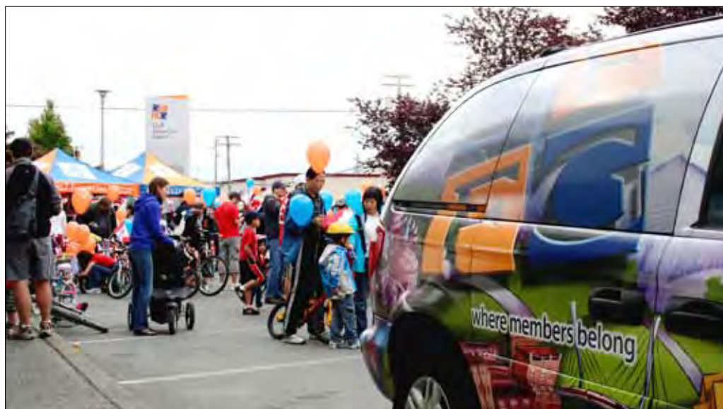
At G&F Financial Group, employees are motivated and encouraged to give back to the community.

In business for more than 70 years, it has more than 27,000 members and currently employs 180 people.