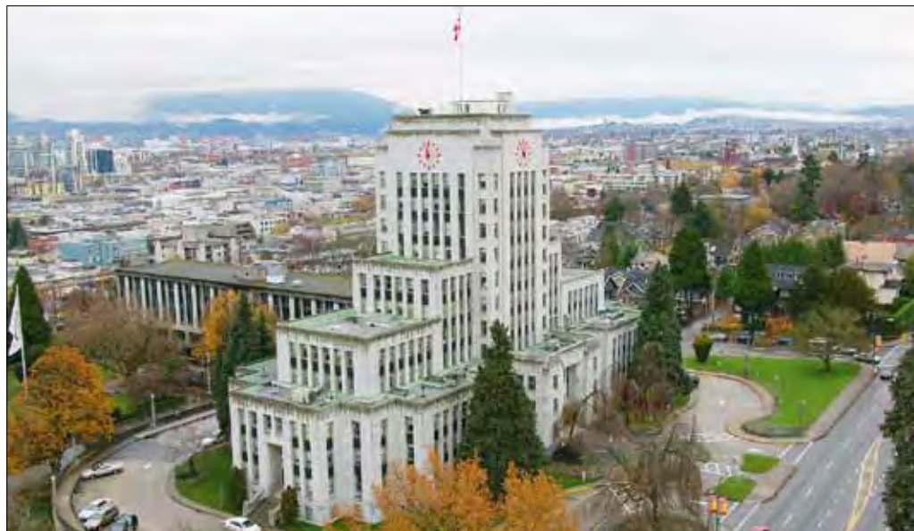
Vancouver City Hall.

The City was also named one of Canada's Best Diversity Employers in 2011 because of its staff's commitment to a pilot mentorship program for immigrants. The City invited 13 immigrant mentees who were matched with various employees in an effort to build skills,